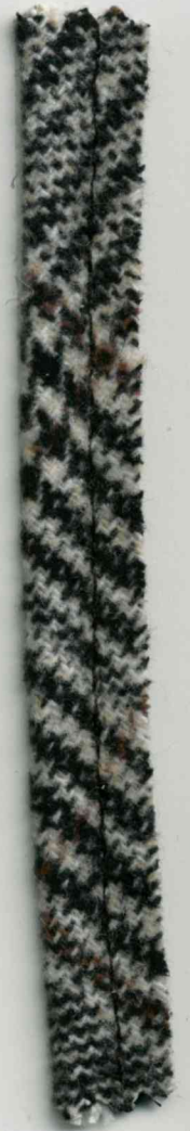
Paspoil 22/11 mm