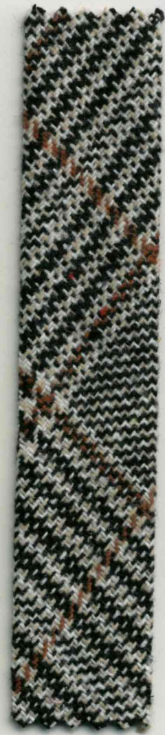
Bias binding 44/25 mm