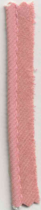
Paspoil 22/11 mm