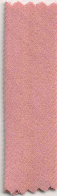
Bias binding 40/20 mm