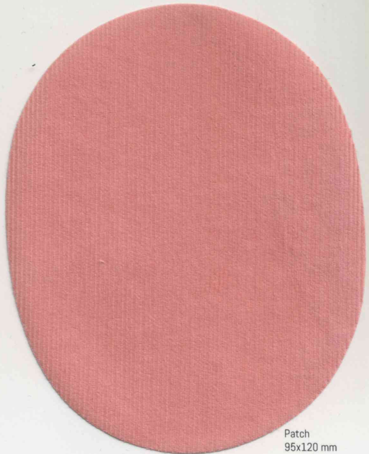
Patch 95x120 mm