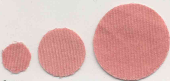
Buttons 9 mm