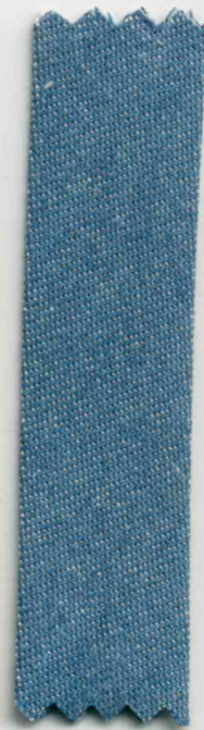
Bias binding 40/20 and 44/25 mm