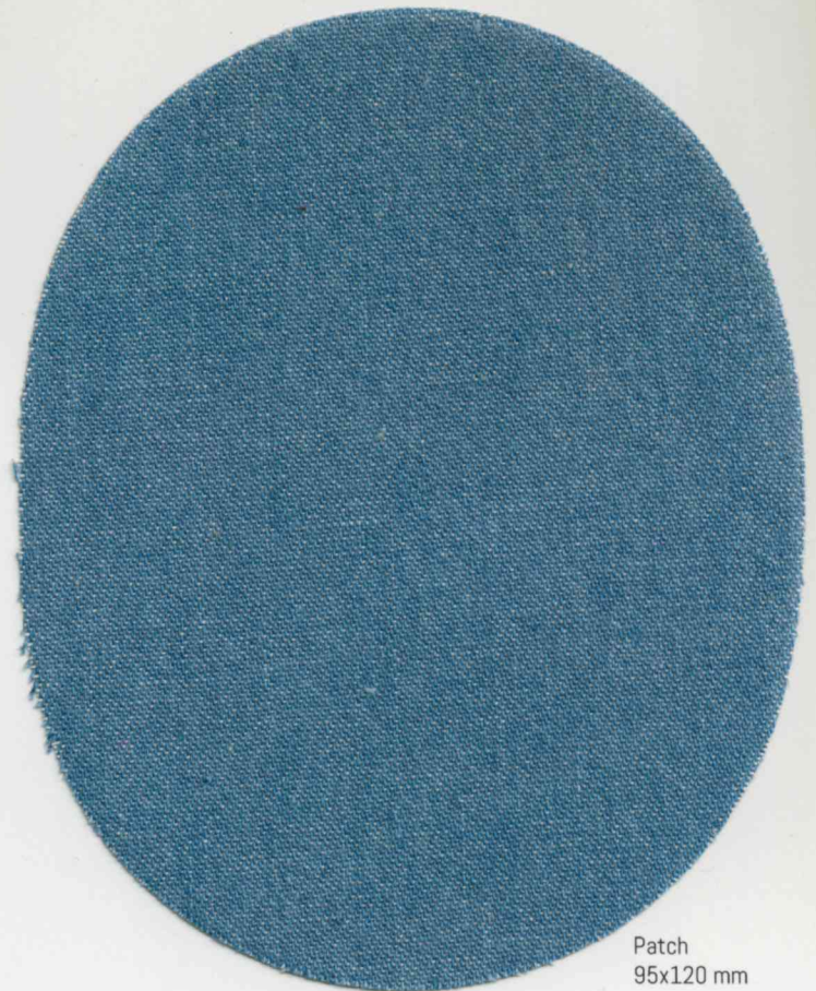
Patch 95x120 mm