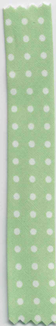
Bias binding 40/20 mm